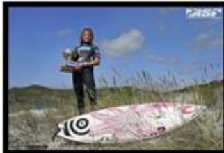
Pauline Ado Surfeuse pro