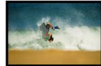
Pierre Louis Costes Bodyboarder pro

Deux fois champion d'Europe 4eme classement mondial