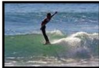
Antoine Delpero Longboarder pro